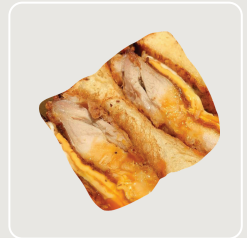
CHEEKY FELLA 16.5 Fried juicy thick chicken thigh, Scrambled, Garlic Aioli, Ranch