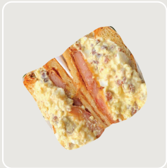
SUNDAY CALS 14.5 Creamy egg salad, Crispy spam, Bacon bits, American cheddar, house-made white sauce