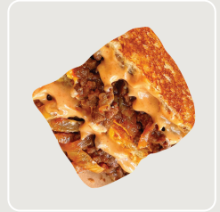
CALI 14.5 Spicy lean beef, American cheddar, Pickles and Special sauce