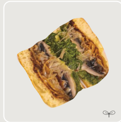
MAGIC MUSHROOM 15 Baked organic portobello with mozzarella, Creamed spinach and Crunchy enoki strings