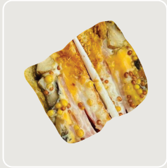
CROQUE MONSIEUR 13 Honey glazed ham, Baked organic portobello, Mustard mayonnaise