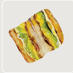
COUNTER BREKKIE 13.5 Smoked pork bacon, Organic avocado slices, Over easy and Sriracha butter