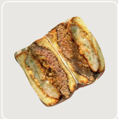
1-800-SURF-N-TURF 25 House-made Wagyu Beef Patty and Prawn patty, Caramelised onions, special sauces