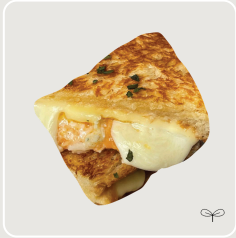
CHEESES 13.5 Garlic Grilled Cheese